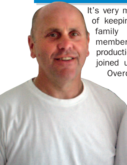
It's very much a case of keeping it in the family for two members of our production team who joined us last year. Overcoming