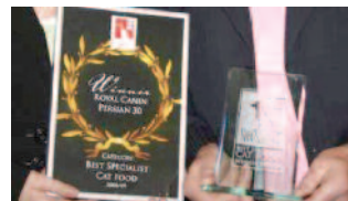
Best Specialist Cat Food Award