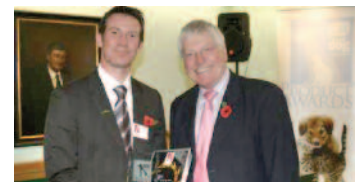
Products of the Year Awards