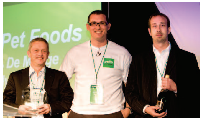
Pets at Home Supplier of the Year Award

We were also honoured to win the Pets at Home Supplier of the Year Award, presented for our high class foods, excellent service and dedication.