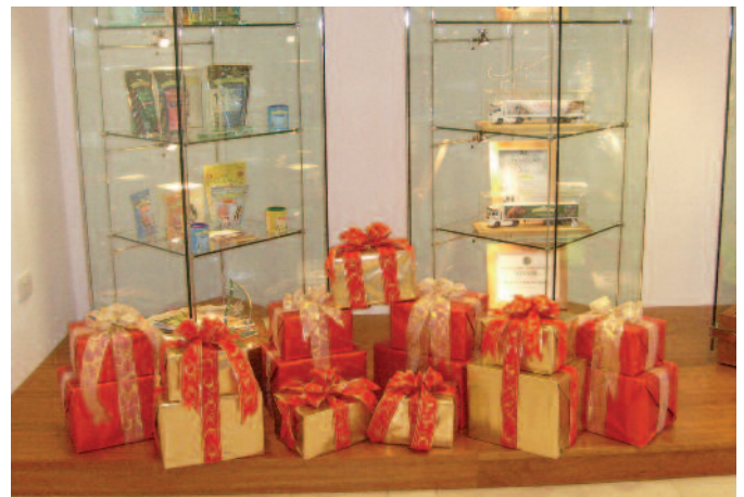
Christmas parcels at Crown Pet Foods